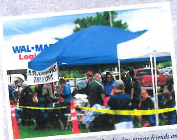
Trucking companies set up camp for the day, giving friends and family shelter, food and fellowship.