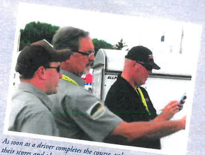
As soon as a driver completes the course, volunteer runners take their scores and place them on the score sheets displayed on the side of the trailer.