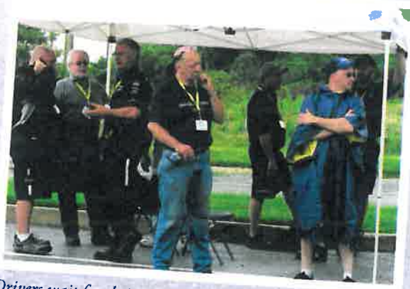
Drivers wait for their turn to do the pre-trip inspection.