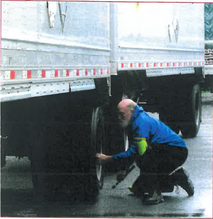
Puddles or no puddles, to do a proper pre-trip inspection, you have to look under the truck, in the wheel wells, and around the tires.

was the TDC chairman in 2012, organized the first Safety Day this year, and is active in the Share the Road program, among other safety activities.